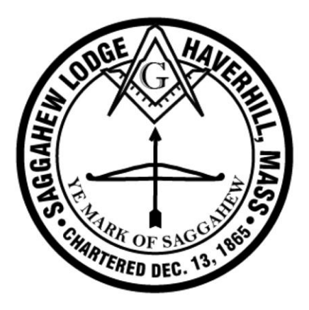
111 Merrimack Street Haverhill, Essex 01830

Saggahew Lodge has been and still is a great example of how freemasons should meet. Our ritual is exceptional, our membership is stable, our attendance good and our doors are always opens to visiting brethren. We look forward to another 150 years.